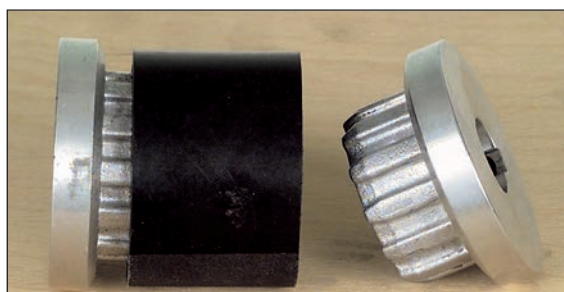
REF. ACC1-19 + AC43 + ACC1-19

These are spare parts, the rotating machines are fitted with their original couplings. A complete set of spare part couplings comprises 2 metal hubs and a rubber sleeve (3 references in total)